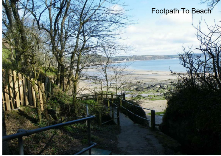
Footpath To Beach